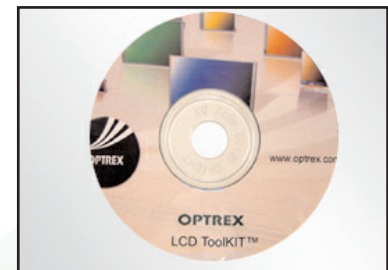
I Quick Set-Up and Document CD-ROM

Optrex America, Inc. 46723 Five Mile Road Plymouth, MI 48170 Tel: 734-416-8500 • Fax: 734-416-8520