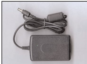
E 12V DC Power Supply (ACCY-PWR-40W)