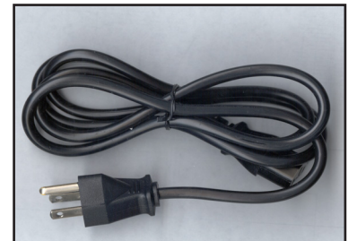
F Power Supply AC Line Cord (AE1123-ND)