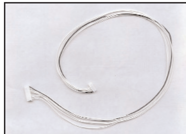
D Inverter Power Cable (H4106460)