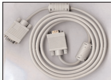
G VGA (Analog RGB) Cable (ACCY-CBL-VGA)