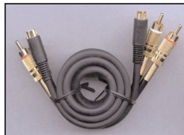
H 3-ft Video Input Cable (S-Video/Composite) (15-1576)