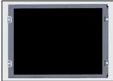
A TFT-8.4", VGA Panel Resolution 640 x 480 (T51638D084-FW-A-AA)